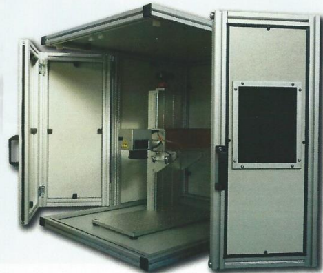
Gold Line laser complete of Class I protection cover with frontal closing doors to mark bulky pieces

All our laser machines can be customized basing on customer's needs. We provide Class I protection cover , complete of inspection window made of certificated glass against Yag radiation.